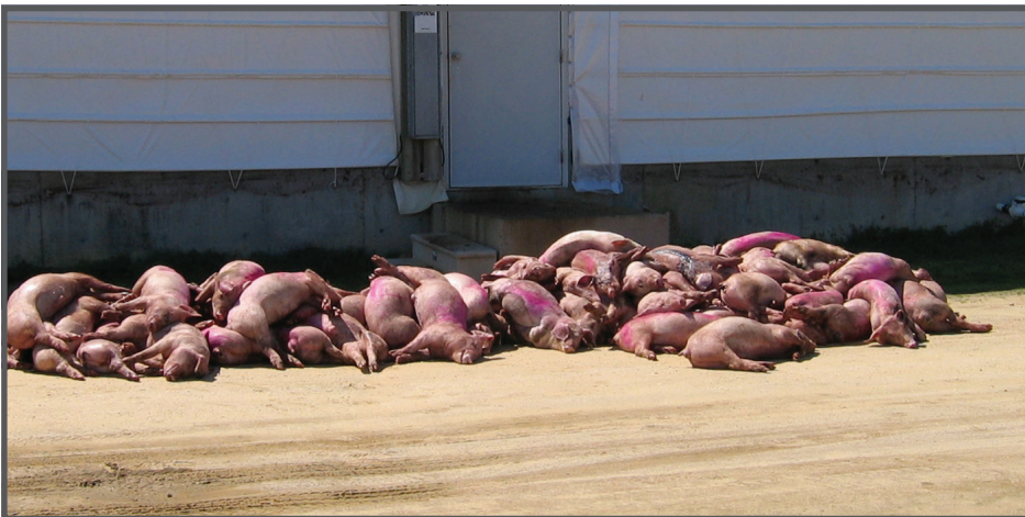
HIGH DEATH LOSS

African swine fever (ASF) is a highly contagious and deadly viral disease of pigs. Pigs infected with ASF may look similar to animals infected with other diseases including classical swine fever, porcine reproductive and respiratory syndrome (PRRS), and porcine circovirus associated disease (PCVAD). Possible signs of disease are shown below.